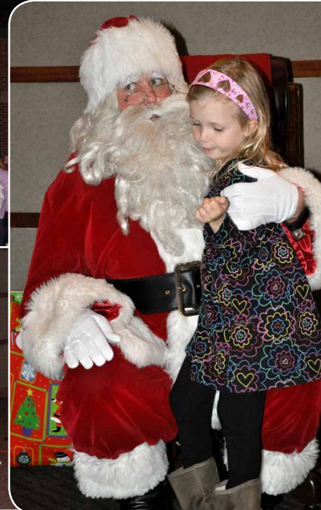
Clockwise from top: Participants sing as the tree is lit during Make the Season Bright in Scottsville; Santa gets a hug from an admirer; and fifth graders from St. Joseph School entertain participants at Make the Season Bright in Bowling Green.

To all of those who donated to and participated in Make the Season Bright, the Foundation would like to say a resounding "thank you!" This year, the Make the Season Bright programs in Bowling Green, Scottsville and Franklin raised over $10,000 from more than 400 donors who purchased Christmas tree lights to benefit the patients of Commonwealth Free Clinic.